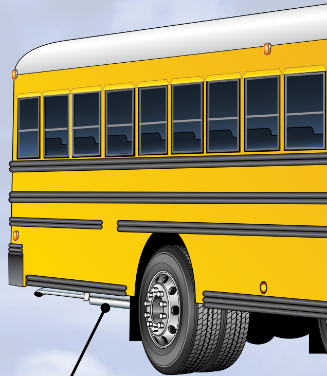
Muffler and Accessories